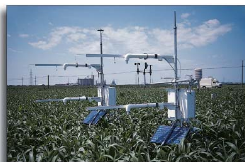
Bowen ratio systems measure temperature, water vapor, and carbon dioxide gradients over sorghum (Lincoln, NE).