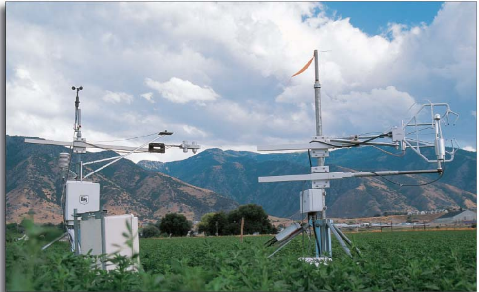
Field intercomparison of fast response sensors measuring surface fluxes of heat, water vapor, and CO 2 (Cache Valley, UT).

Campbell Scientific offers research-grade instrumentation for micrometeorological applications including measurement of sensible heat, water vapor and trace gas fluxes, and atmospheric variables required by air quality dispersion models. We also offer a variety of automated weather station configurations.