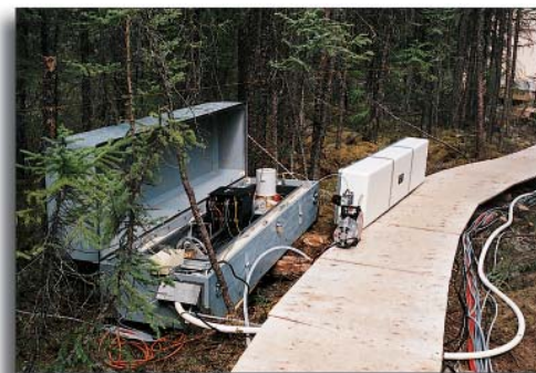
A trace gas analyzer uses TDLAS technology to measure N_2O or CH_4 fluxes during BOREAS (Prince Albert, SK, Canada).