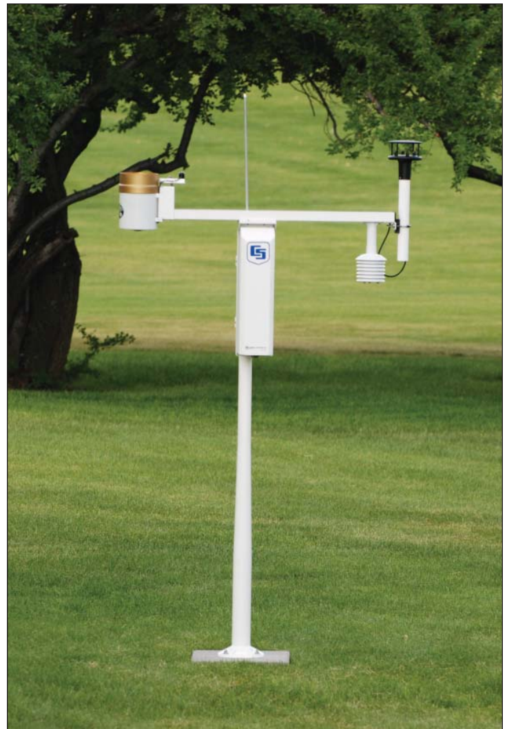
The ET107 provides real-time weather measurements and calculates ET_0 on an hourly and daily basis.

Digital cellular phones, spread spectrum radios, and voice synthesized modems may be used for some applications; contact Campbell Scientific for more information.