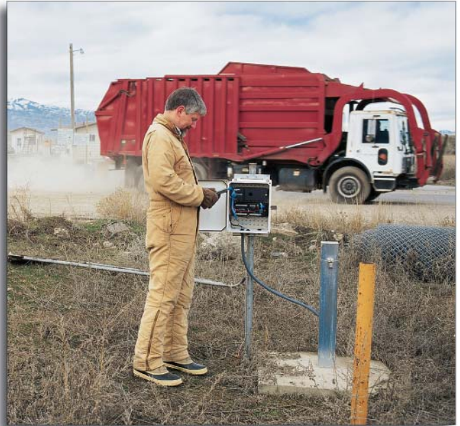
Our dataloggers are typically interrogated via telecommunications from an office, but you can also access the data on-site.

The availability of multiple communications options for transmitting data also allows systems to be customized to meet exact needs. Systems can be programmed to send alarms or report site conditions by calling out to computers, phones, radios, or pagers. Real-time or historical data can be displayed or processed with Campbell Scientific software. Data can also be exported as ASCII files for further processing by spreadsheets, databases, or analysis programs.